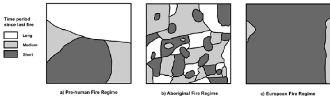
Figure 1 Schematic representation of the "three great ages of fire in Australia" in a hypothetical tract of tropical Eucalyptus savanna 3

(a) 'Wild' In the pre-human period, lightning started fires infrequently and burnt large areas, creating a coarse habitat mosaic to which various species of birds and mammals had become adapted. (b) 'Tamed' Aboriginal fire management was characterised by a high frequency of fires that burnt much smaller areas, producing a fine-scale habitat mosaic that supported most of the pre-human wildlife assemblage. (c) 'Feral' Under European fire management, fires, that had a similar frequency as the Aboriginal period, burnt large areas thereby obliterating the pre-existing habitat mosaic created by Aboriginal landscape burning.