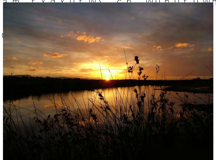
on visit to Launceston, TAS